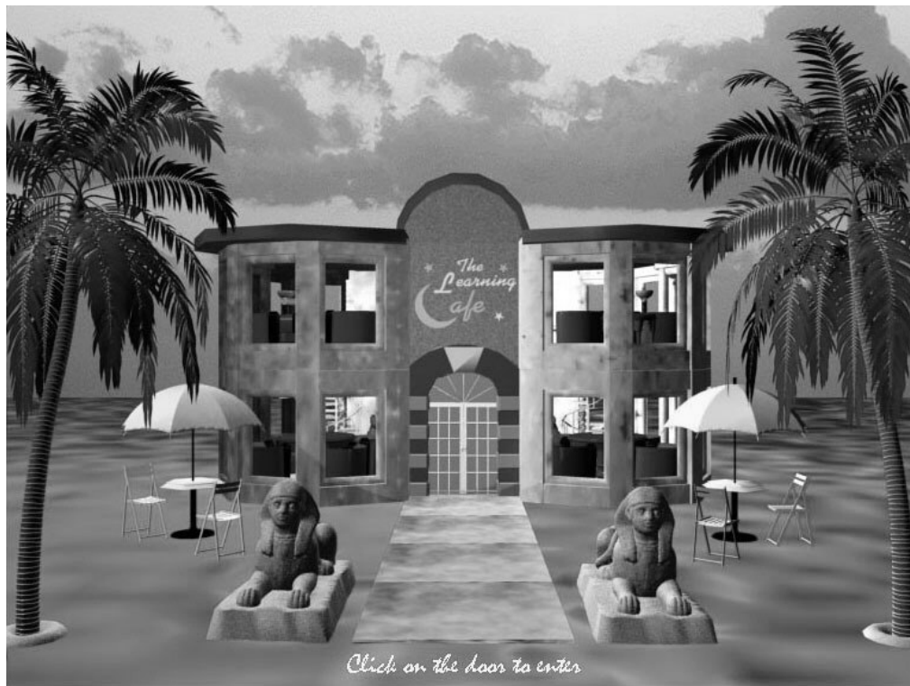
Figure 2: Outside the Learning Café

Upon startup, the browser retrieved the server's Internet address, the locations of the shared files, and other customized information from an initialization file. It checked the Internet connection, and in the event the lessons and/or database were inaccessible via the Internet, then the lessons were retrieved from a local source. Although student performance records could not be maintained on the local source, it at least permitted students to continue to work until the server, network, or connection was repaired.