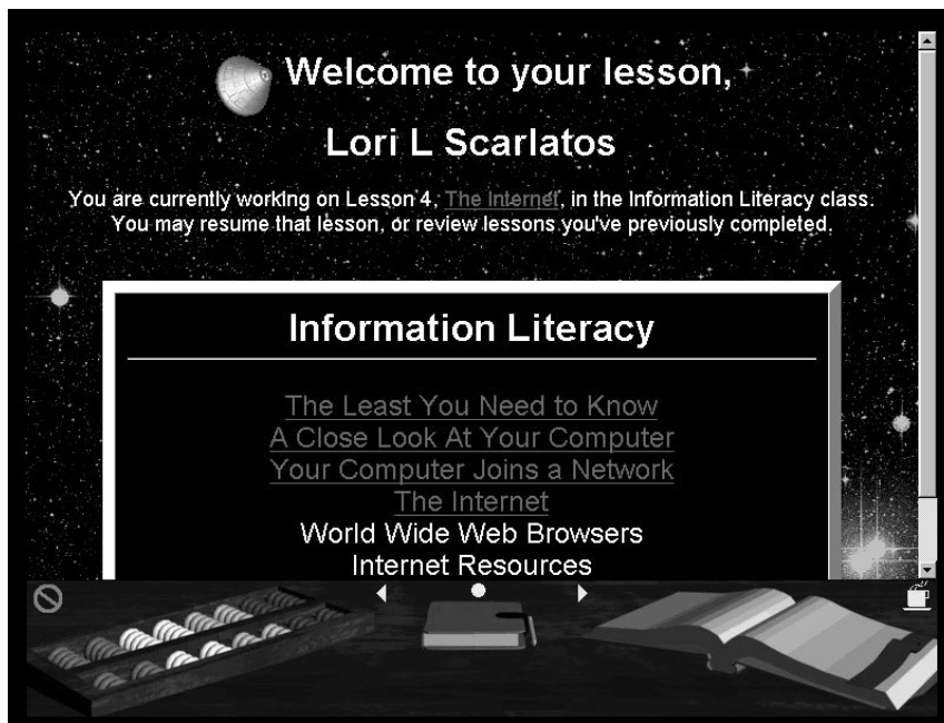
Figure 3: Welcome Page in the Lessons

At the same time, this database system gathered information about who was doing what in the Learning Café. Instructors and administrators could then use this information to gauge student progress and assign grades.