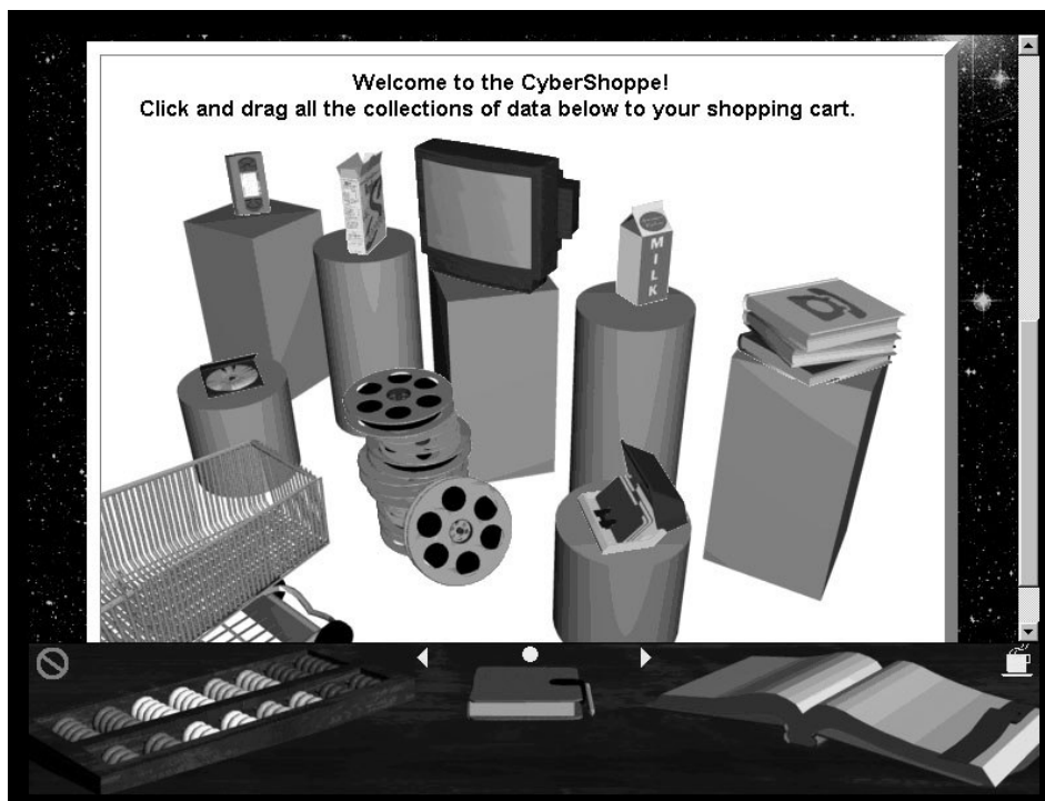
Figure 4: Multimedia Enhanced Exercise

Key to the success of this endeavor was the development process. Developing the lessons in the